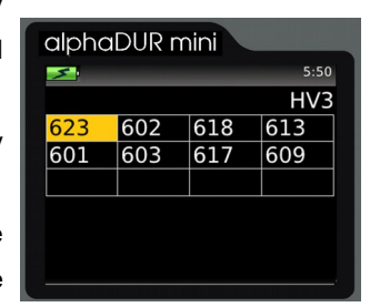
Fig. 6: Values

To delete a value the marker is set onto the corresponding value and then DEL must be pressed.