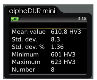
Fig. 5: Statistics

measurements (as set in the measuring parameter) has been made, the key STAT is pressed or if a measuring series is completed. In the first view are the following information displayed: average value, standard deviation, relative standard deviation (standard deviation in % of the average value), minimum, maximum and the number of values. Standard deviation