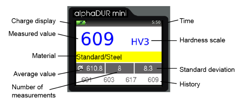
Fig. 4: Measuring window