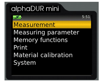
Fig. 2: Main menu

Press ESC to return to the previous menu.