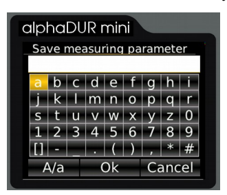
Fig. 3: Text entry

When saving measurement data and measurement parameters, entries must be made in plain text. In these cases, the text entry window is opened.